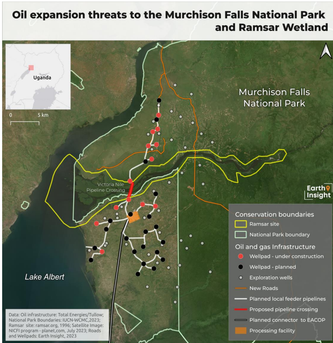
A map showing oil infrastructure affecting a Ramsar wetland and other areas in MFNP